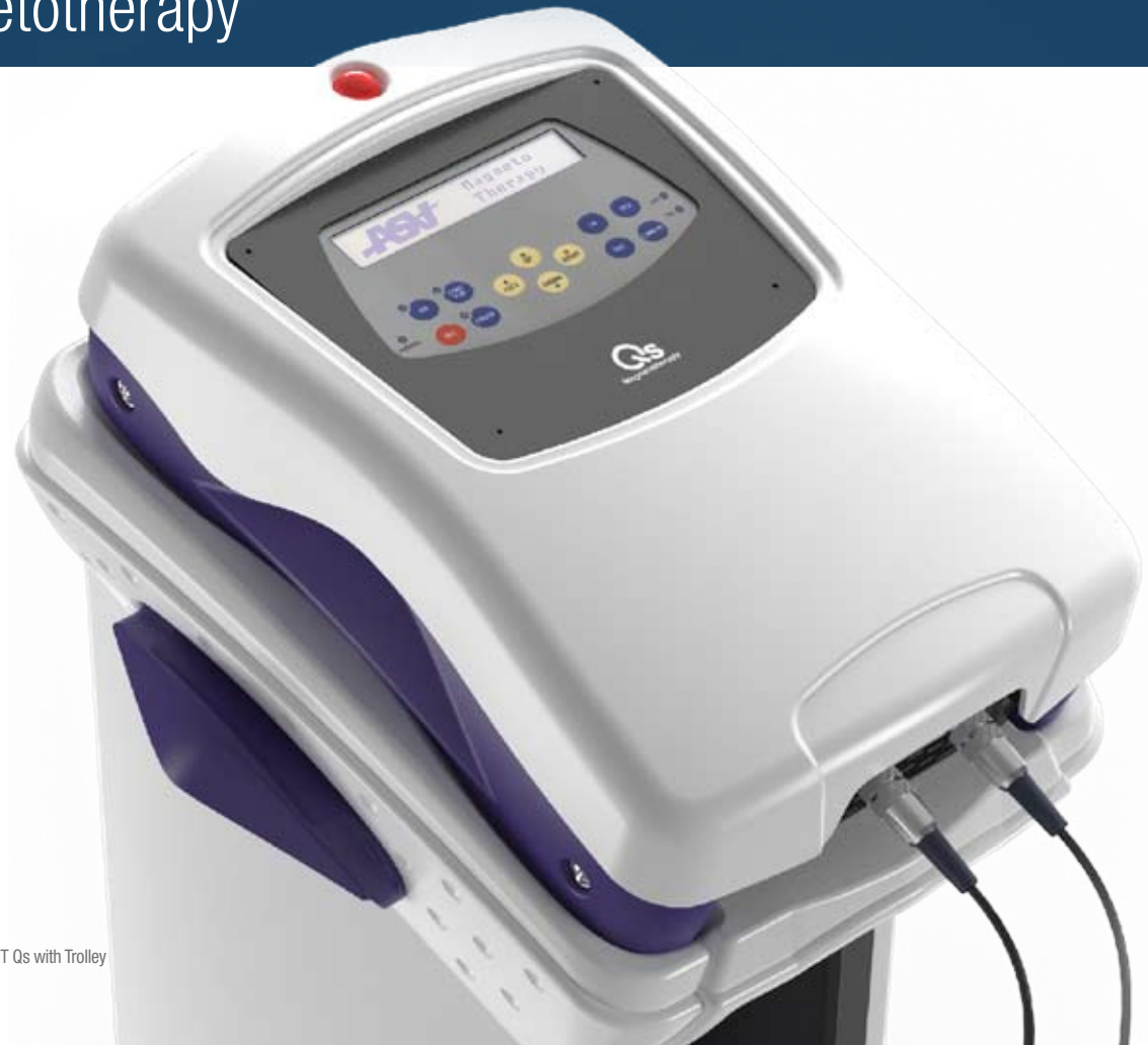
Generator PMT Qs with Trolley