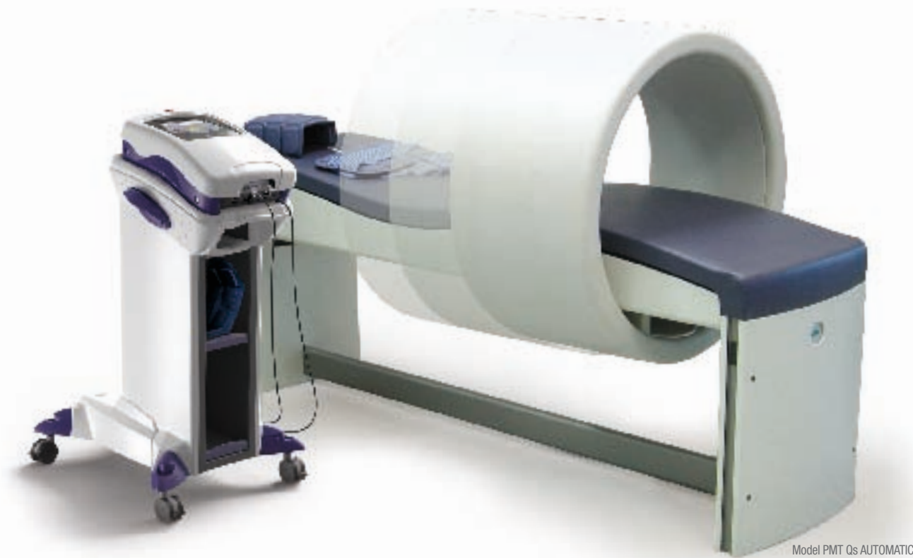
Model PMT Qs AUTOMATIC